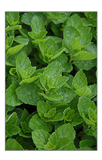
Spearmint foliage

This is an herbaceous perennial herb with a spreading, ground-hugging habit of growth. Its medium texture blends into the garden, but can always be balanced by a couple of finer or coarser plants for an effective composition. This is a high maintenance plant that will require regular care and upkeep, and should be cut back in late fall in preparation for winter. It is a good choice for attracting bees and butterflies to your yard, but is not particularly attractive to deer who tend to leave it alone in favor of tastier treats. Gardeners should be aware of the following characteristic(s) that may warrant special consideration: