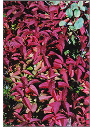
Bush Honeysuckle in fall

This shrub does best in full sun to partial shade. It is very adaptable to both dry and moist locations, and should do just fine under average home landscape conditions. It is not particular as to soil type or pH. It is highly tolerant of urban pollution and will even thrive in inner city environments. This species is native to parts of North America.