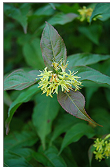
Bush Honeysuckle flowers