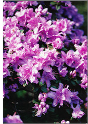
Ramapo Rhododendron flowers