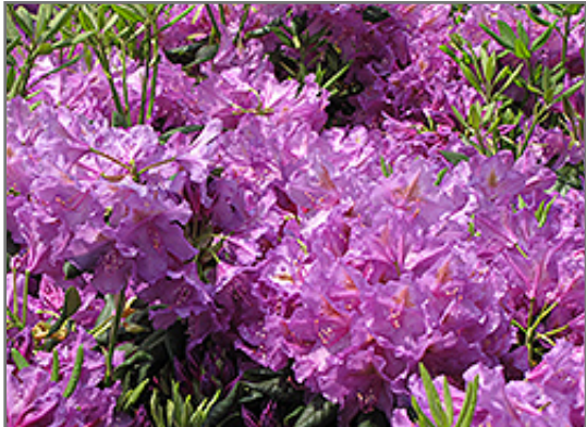
Lee's Dark Purple Rhododendron flowers

Lee's Dark Purple Rhododendron is a multi-stemmed evergreen shrub with an upright spreading habit of growth. Its relatively coarse texture can be used to stand it apart from other landscape plants with finer foliage.