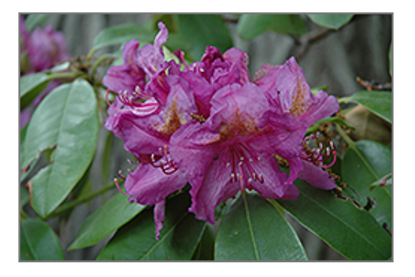
Lee's Dark Purple Rhododendron flowers