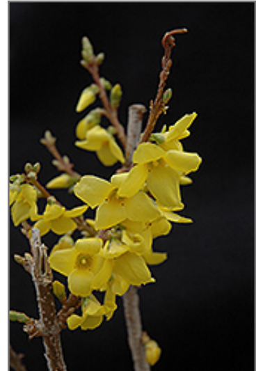
Show Off Forsythia flowers

Show Off Forsythia makes a fine choice for the outdoor landscape, but it is also well-suited for use in outdoor pots and containers. With its upright habit of growth, it is best suited for use as a 'thriller' in the 'spiller-thriller-filler' container combination; plant it near the center of the pot, surrounded by smaller plants and those that spill over the edges. It is even sizeable enough that it can be grown alone in a suitable container. Note that when grown in a container, it may not perform exactly as indicated on the tag - this is to be expected. Also note that when growing plants in outdoor containers and baskets, they may require more frequent waterings than they would in the yard or garden.